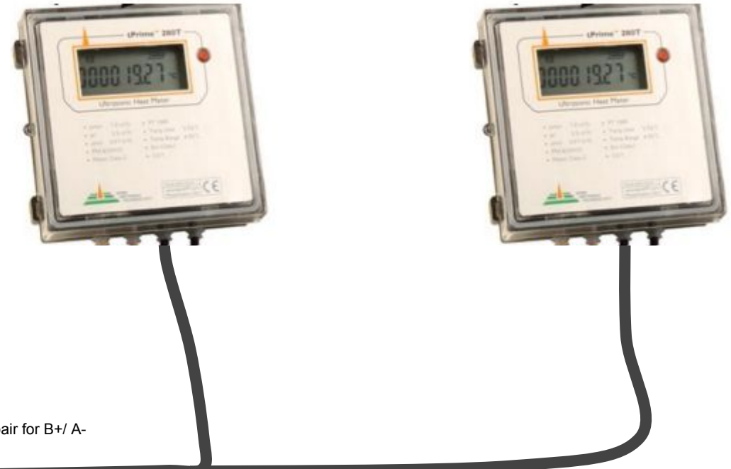
BTU Meter (N+1)