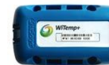
WiTemp+ - battery powered