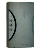
SiteSage V5 Gateway - connects to buildings network via ethernet or wireless